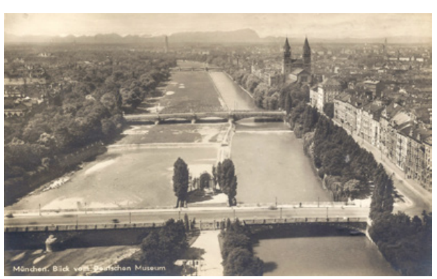
The Isar in its "Korset" seen from the Deutsches Museum: Partie an der Isar mit Blick gegen das Gebirge, 1928. Blick vom Deutschen Museum, 1939 (Postcards, details, collection of the author)