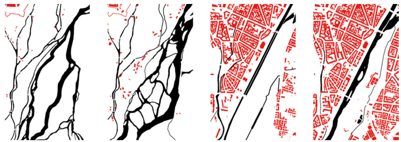
Isarraum South of Munich: river arms and buildings in 1704, 1808, 1891, and in 2011 after completion of the Isar Plan.

Historically, Munich thus long maintained a safe distance from the turbulent alpine river, as the location of Eastern Gate still shows: the Isartor built in 1337 kept the Isar at a distance of about 400 meters. Four hundred years later, the plan drawn by Maximilian de Groth still showed sparse urbanization between the Isartor and the stream, although the river was partly contained on its western side. In the late nineteenth century, Munich finally followed the principles of engineer Johann Tulla, known as the "Man who tamed the Rhine," who wrote: "Every river or stream needs only one bed, and if it has several arms, one should work towards a narrowed stream. It should be kept as straight as possible" (Vischer, 2000). Only geometry and functionality could beautify rivers, naturally erratic and dangerous. Following these precepts, the Isar was progressively narrowed and straightened, a parallel flood meadow being kept along the main riverbed to buffer summer floods, and a few side branches remaining for the sake of hydropower plants.