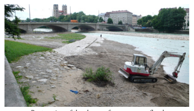
Restoration of the shores after a summer flood

Besides resisting regular floods, the hydraulic function of the floodplain also implies that no buildings can be built in the high-water channel, limiting any public facilities established there. But, then again, these constraints put on formalized and commercial activities are highly valued by the inhabitants: "You can't have events happening, and people like it for that: there is nothing you have to pay for, no beer gardens...It's a nice thing to have, such a space that is...empty" (Engelmeyer, 2013). Beyond romantic formalism, Munich has created an open space with no predefined use or program, a space that is officially not a regulated park, not a flood zone and not a protected nature reserve, and yet it is a hybrid of all these together. The lack of predefined program and the freedom of use provided in a dense urban environment is valued as liberating in contrast to fully equipped and commercial urban spaces. It allows the city to be again a place of improvisation and user-defined activities, from solitary meditation to family picnics and collective binge-drinking, restoring the essence of a public