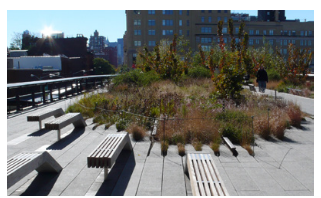
High Line, New York City (Field Operations, Piet Oudolf)

Originally started at the edge of the city, the Isar Plan—named after the stream that flows from the Alps through Munich to the Danube—was consistently pulled through the city to Museum Island, in the heart of the city, and is now planned to expand further downstream along the historical Englischer Garten. For its vast scale and popular interest, the Isar Plan can already be considered as the most comprehensive floodplain restoration plan yet made