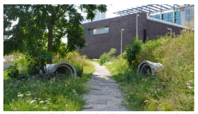
The New Garden, Rotterdam (Frans Bruggeman and Hans Engelbrecht, photo Rossano, 2015)

As the New Garden and the Isar Plan suggest, the demand for informal, fluctuant, unprogrammed and "dirty" landscapes should in both cases be acknowledged as the expression of a genuine cultural