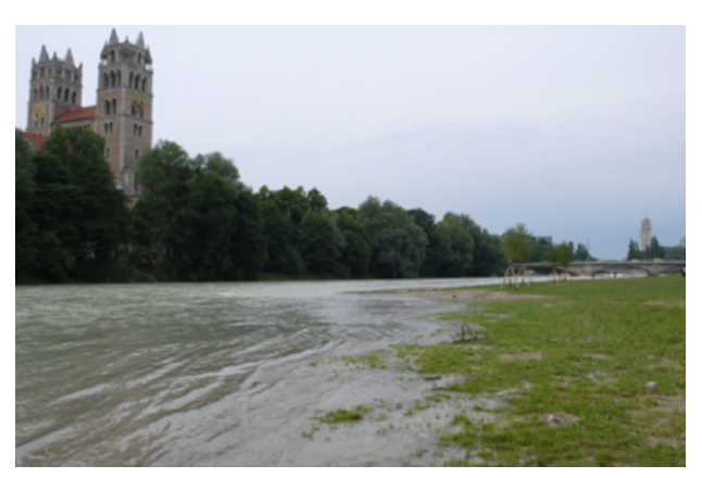
Isar riverbanks after completion of the design, stream at high and low river discharge (photo Kuenzel/Rossano, summer 2013)

actually having its performative characteristics: The "renaturalization" label retrospectively put on the design appears illegitimate in many ways.