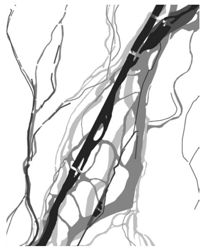
The river course in 1704, 1808, 1891 and 2011, after completion of the Isar Plan (from light gray to black)

In terms of morphology, the riverbed is still very far from having recovered its original width and meandering nature, as a simple comparison of the river's past states shows. Although it mimics a natural stream, the new shore remains as fixed as it was a century earlier: shore variability is as limited as before, as it is stabilized by invisible foundations, and the stream still tends to follow the deepest channel on the left bank side. Occasionally, alluvial materials have to be redistributed mechanically by bulldozers in order to restore the area after flooding – indicating that while the two fundamental river processes of erosion and deposition were considered in the design, its morphology was meant to be kept in a fixed shape. Finally, the new shallow slopes intensively used by the public leave no space for alluvial vegetation and attendant habitats to develop. As landscape architect Oliver Engelmeyer clearly puts it, people had "thought [our first design] was wrong because [water] management was made visible. Now we still have the same issues, hidden beneath the greenery, and every time there is a flood you have to put it back in again" (Engelmeyer, 2013). All in all, the Isar now can be seen as a man-made channel in drag, defined by urban uses and constraints but shaped in order to make it look like a wild alpine river without